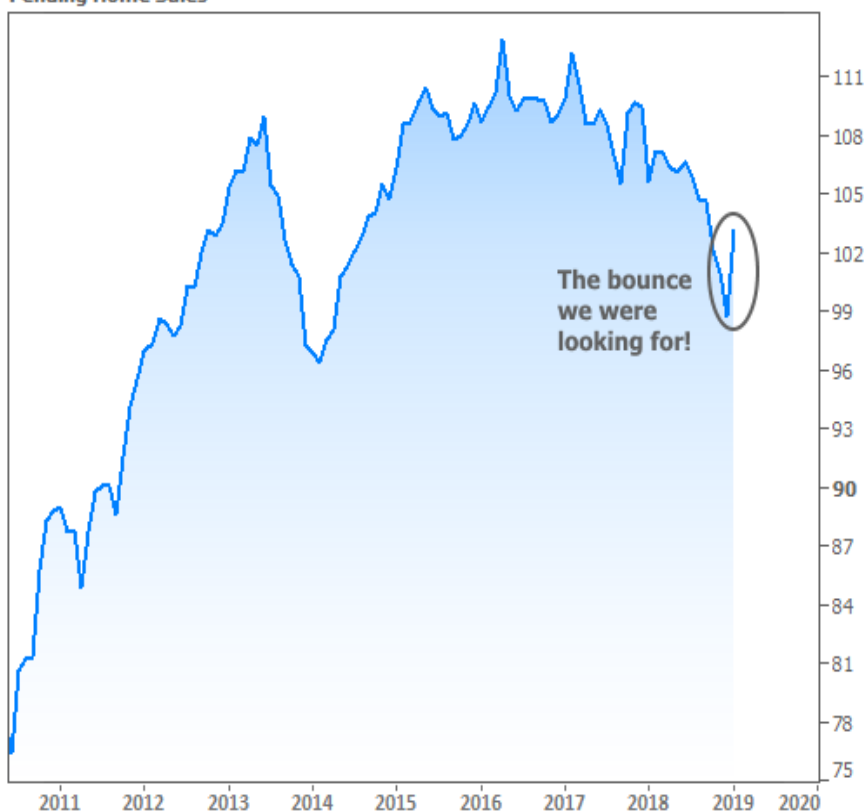
Pending Home Sales

Unfortunately, we also saw the beginning of a fairly abrupt move higher in rates on Wednesday. Early that morning, underlying bond markets (which dictate mortgage rates) began to look panicked. It wasn't immediately clear what caused the move although Brexit-related news was the leading