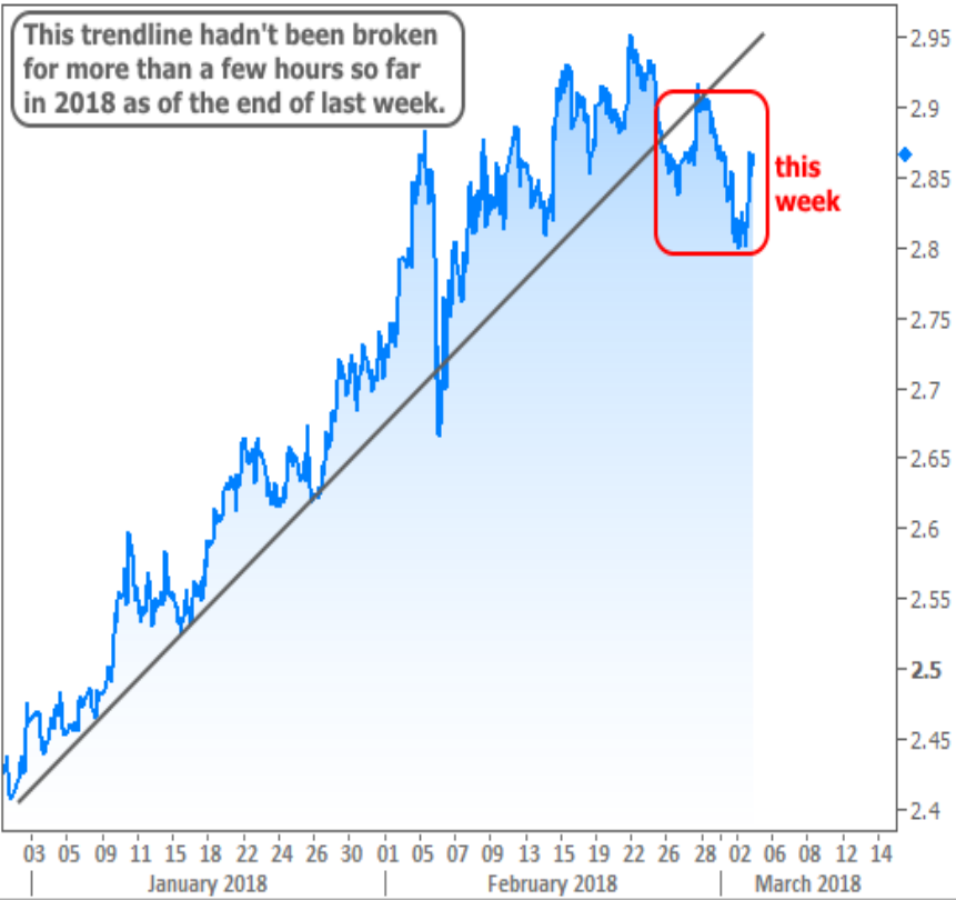
US 10yr Yield ("rates")