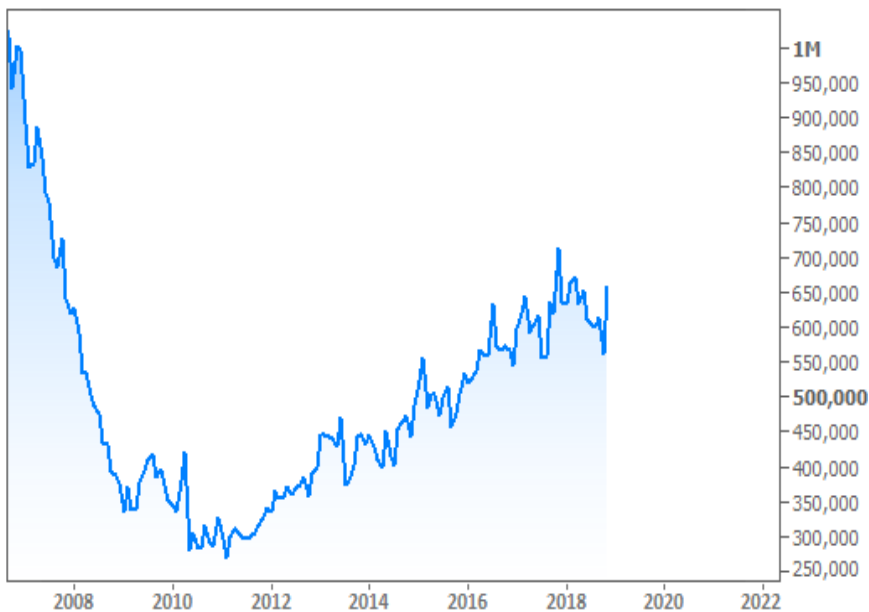
New Home Sales

In the same report, median prices of new homes had a completely different experience. They fell sharply.