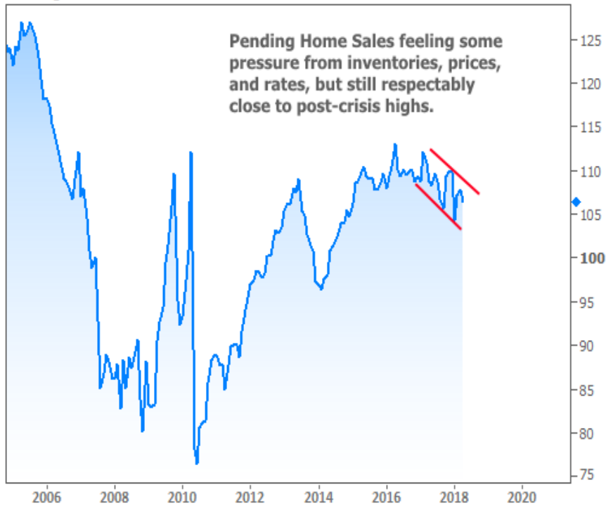
Pending Home Sales

Subscribe to my newsletter online at: http://housingne.ws/mvloans