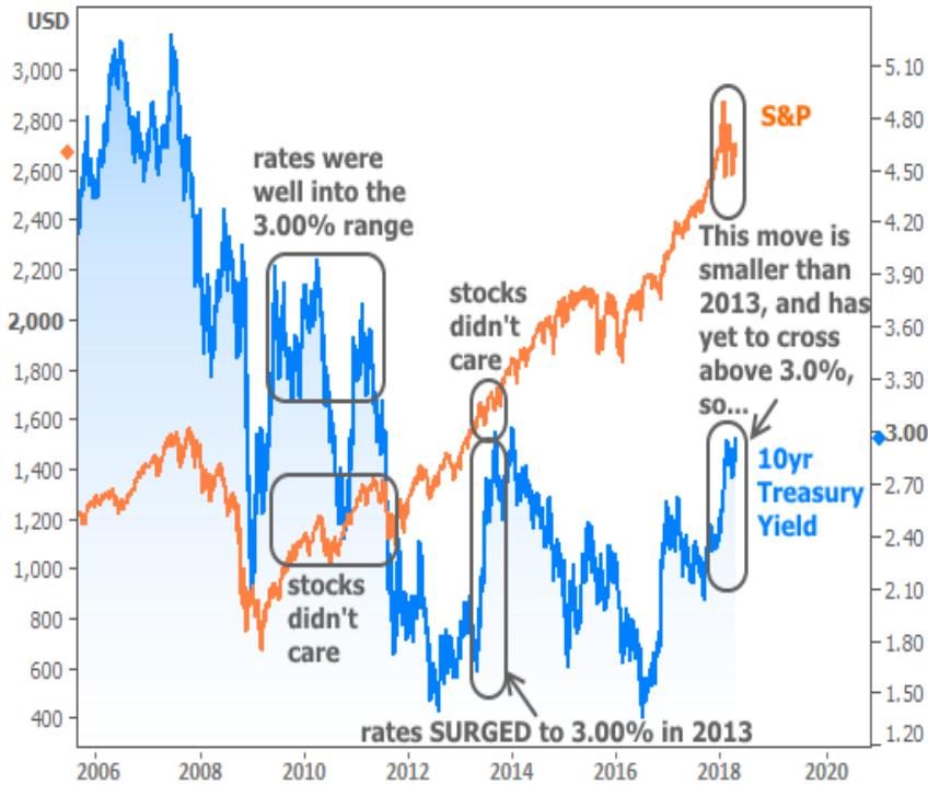
Stocks vs Bonds

How about the stock market? It was fairly tough to tune-in to financial news this week without seeing the rate spike being blamed for slumping stocks. Rather than bore you with words, I'll just leave the following chart right here ( conclusion: stocks didn't care about 3% 10yr Treasury yields in the past, nor did they care about a much bigger rate spike in 2013):