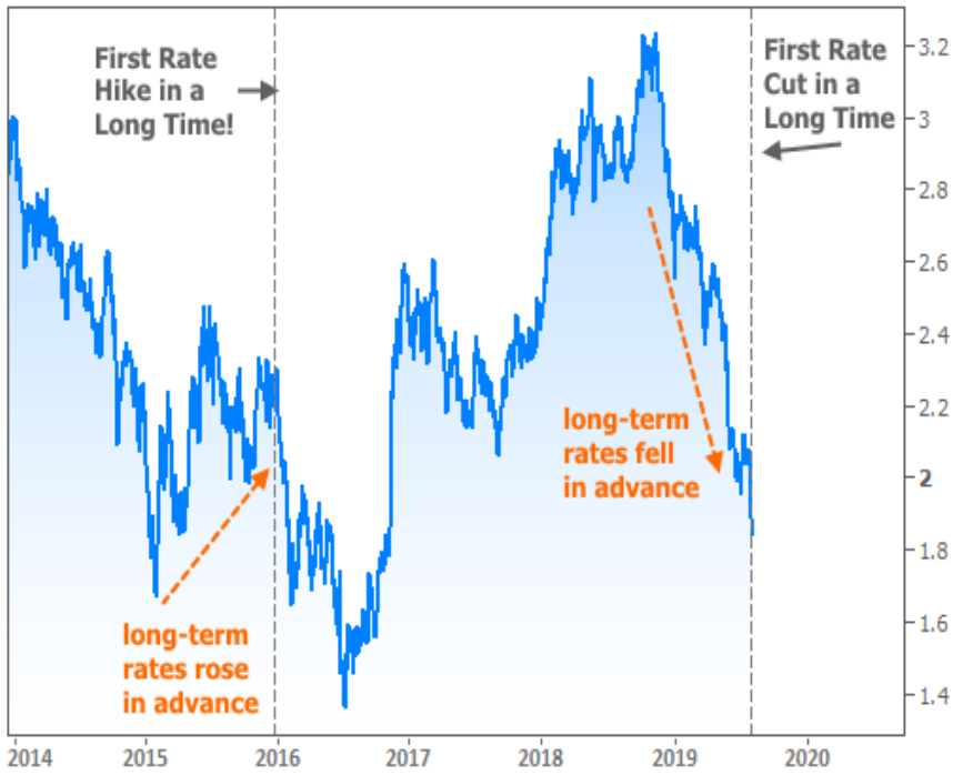
Rates Move Before Fed

To emphasize the point in even simpler terms, consider that stocks LOST ground after the Fed announcement, even though Fed rate cuts are considered to be a good thing for stocks. Like mortgage rates, stocks already had plenty of time to PRICE-IN the Fed's move. That left Wednesday for them to react to other information from the Fed. Specifically, they were a bit disappointed that Powell didn't do more to offer assurances about additional cuts. That's why we saw the lion's share of market movement after Powell's press conference at 2:30pm ET as opposed to the rate announcement at 2pm ET.