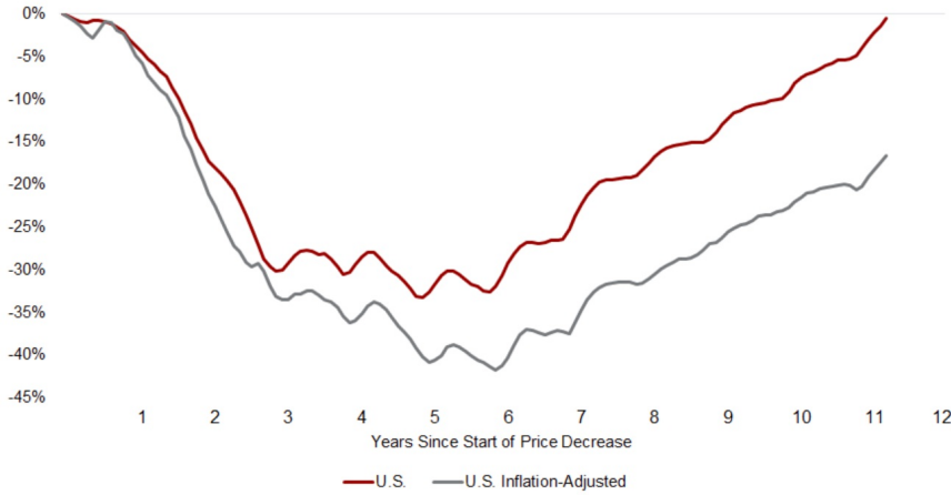
Change in Home Price Index Since Start of Declines (2006)

Boesel says inflation should also be factored into the pace of recovery. From the peak in housing prices through this past July, the inflation has totaled just under 18 percent. When home prices are adjusted for that, the trough was deeper , down 40 percent from the beginning of the cycle, and the recovery shallower; prices remain 17 percent off the peak.