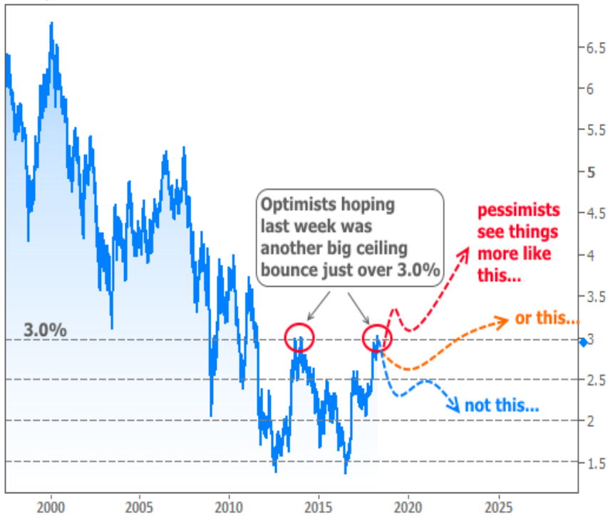
US 10yr Yield

Bonds are also at a crossroads, having just lived through their 2nd encounter with the most important rate ceiling in more than 10 years. We've already discussed reasons that 3% shouldn't be as firm of a ceiling when comparing the present situation to that seen in 2013/2014, but some investors are still holding out hope. Granted, it COULD happen if the bigger picture gets cloudy enough, quickly enough, but the 2 pessimistic scenarios in the following chart of 10yr yields are also on the table.