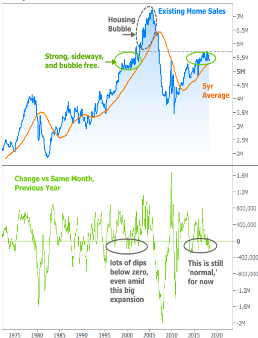
Existing Home Sales

Whereas it might require a deep breath and some perspective to feel optimistic about existing sales, New Home Sales are still very clearly in a linear uptrend. They just happen to be experiencing a move lower INSIDE that trend--one that they've seen at least 4 times in the past 5 years. In fact, the periodic corrections of the past few years are clearly milder than those seen during the previous expansion (as seen at the bottom of the following chart).