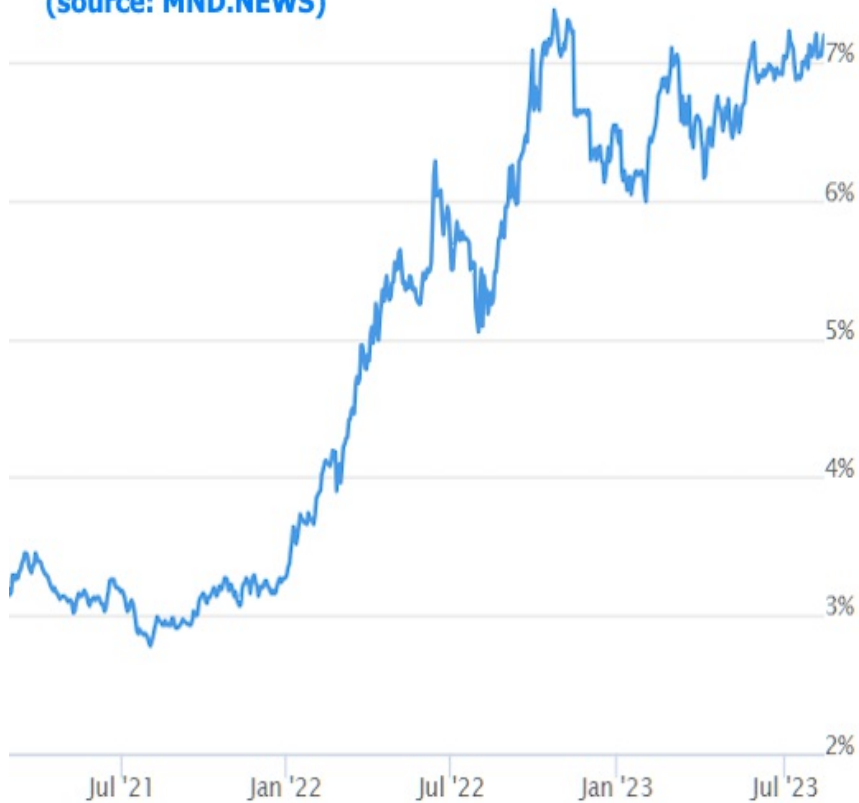
30yr fixed mortgage rate index

This is the new and persistent reality until one of 3 things happens: